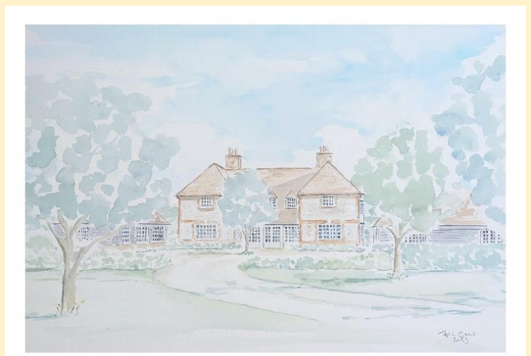
The house which will be built on the site of modern barns.

One month earlier, WBC approved the plan to build a new house on the site of redundant farm buildings at Elm Farm, which for centuries had been the chief farm in the village before being taken over around 1980 by the Organic Research Centre, which broke up the farm and sold it off in 2019. The new owners converted the former farmyard and organic research laboratory into residential accommodation, in addition to modernising the farmhouse separately for rental.