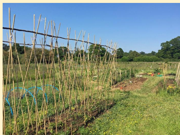
Left, the herb garden and above, part of the veg patch at Good Hope Farm

Karine's enthusiasm for an organic market garden benefiting not only the learning-disabled adults for whom it was created, but all visitors, is infectious. The Carter Jonas volunteers departing at the end of the day looked not so much exhausted as inspired and invigorated. Fresh air, sunshine, herbal aromas and