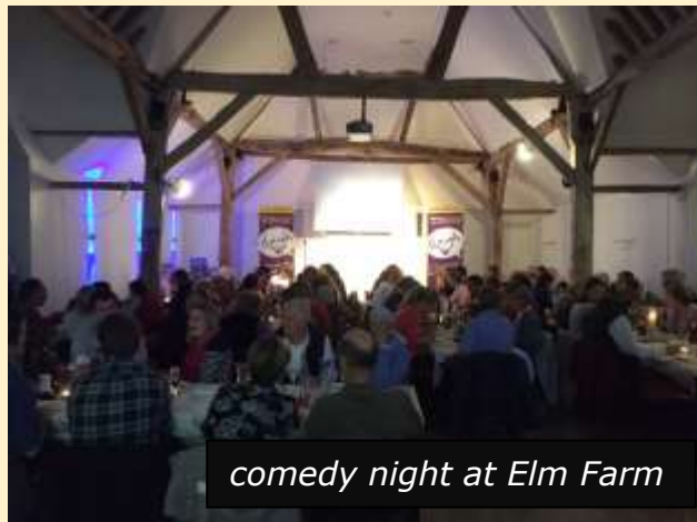
comedy night at Elm Farm

2015 Summer jazz evening at Park Lodge and a comedy night at Elm Farm raise funds for the church. The White Hart closes, and applies for change of use. Campaign to oppose White Hart redevelopment is launched. 4G reaches Hamstead.