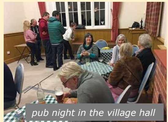
pub night in the village hall

2017 Barn dance at Elm Farm. White Hart redevelopment plan goes to appeal. Dorothy Aromando Art Fund exhibition at Elm Farm. Friends of Hamstead Marshall and Marsh Benham formed. Watership Cantabile concert in St Mary's church. Party in the Parish in recreation field. Gigaclear broadband promised.