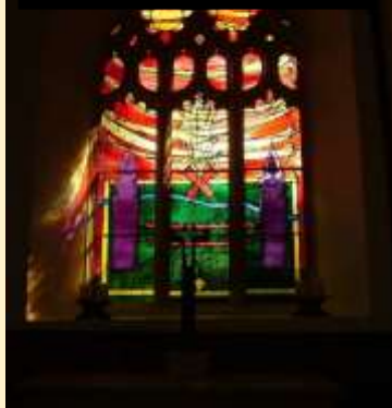
church millennium window