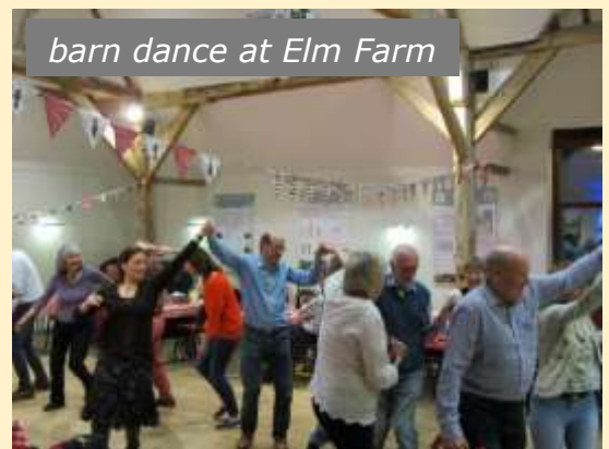
barn dance at Elm Farm

2016 Montessori Preschool opens in village hall. Red Hill cemetery for sale. Another Chapel Corner crash. Campaigners get ACV status for White Hart. Quiz & ploughman's supper at the village hall.