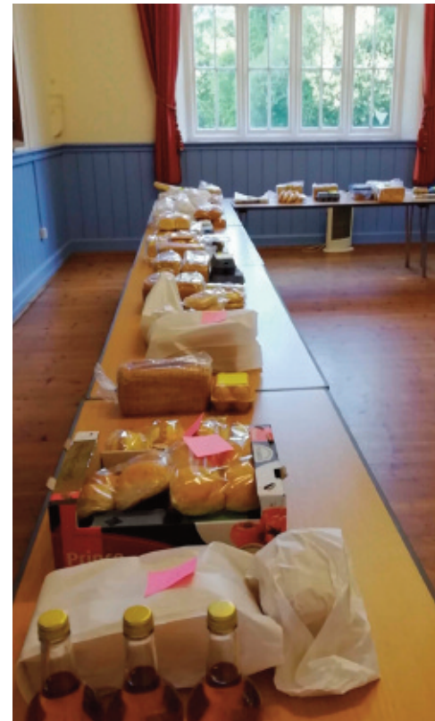
Food laid out for collection at the village hall