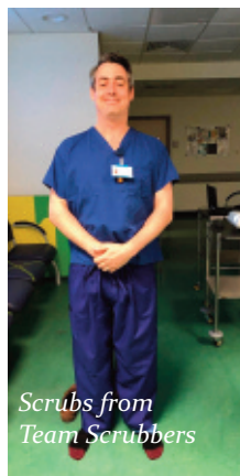
Scrubs from Team Scrubbers

Patterns and fabric had to be sourced. With support from the John Lewis Partner-