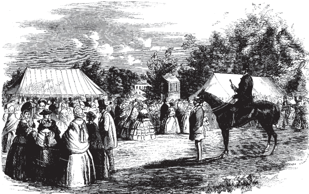
GRAND FETE IN HAMSTEAD PARK, BERKS, IN AID OF THE GREAT WESTERN RAILWAY WIDOWS' AND ORPHANS' FUND.