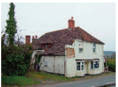
Bailiffs and burglars sacked the premises, and dereliction threatened, until Stella Coulthurst refurbished and reopened the White Hart in summer 2011.