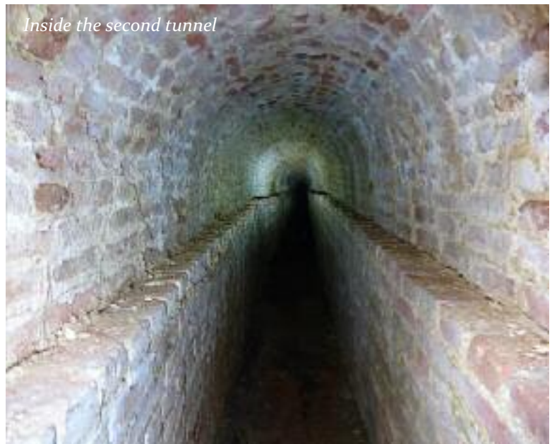
Inside the second tunnel