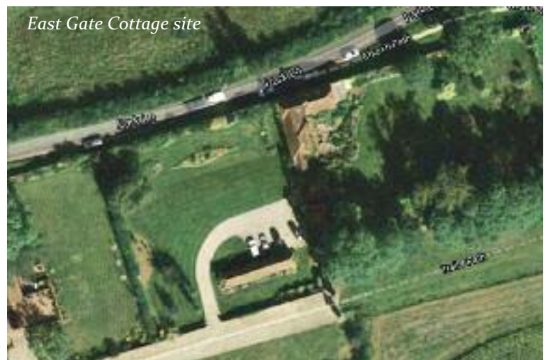
East Gate Cottage site

East Gate Cottage was put up for sale after Alison Oldland's death in 2011. The buyers applied for a two-storey redevelopment of the house, but withdrew their application following heated objections; the house itself is not considered historically sensitive, but the surrounding area and its sight-lines most certainly are. Another sale followed, and the house is now being extensively re-developed as a single-storey dwelling for its new owners, and is expected to be finished in June 2014.