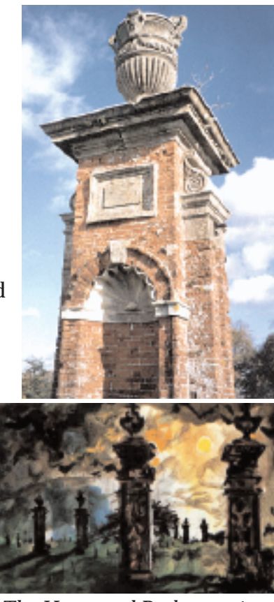
The Hamstead Park gatepiers were painted twice by John Piper (1903-92).

This 1709 engraving of the Craven manor house (which burned down 10 years later) shows 10 pairs of gatepiers in position. One pair has not survived, and another was moved to Benham Park. The three for which restoration is planned are marked by red dots, and can be located in the modern landscape by reference to the church, on the far right.