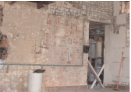
The kitchen is being totally refitted from scratch.