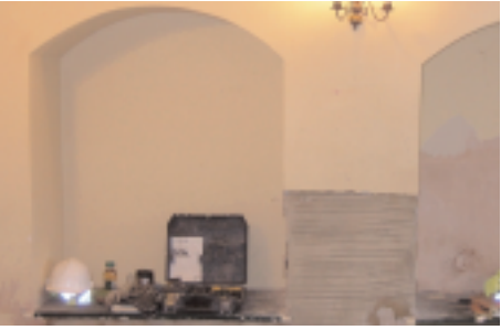
Former blind arches in the dining room will be opened and glazed, showing the kitchen.