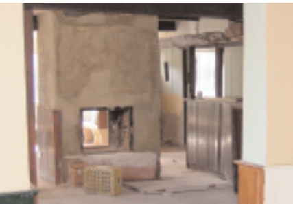
The open fire will burn again – now without smoking out the bar.