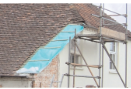
The irregular masonry top left of the road frontage is levelled off with the roofline.

You too can have your say: visit the website below, and state your preferences.