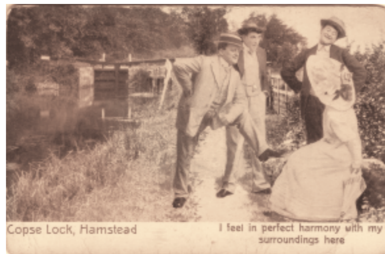
Copse Lock, Hamstead

I feel in perfect harmony with my surroundings here