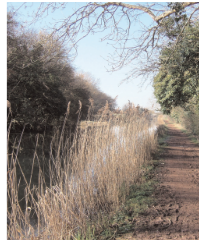
The four walks take in Irish Hill, the canal towpath, Hamstead Park and Holtwood. All are on public rights of way, with minimal roadwork.

To celebrate publication of the leaflets locals are invited to join a group walk on Sunday 28 March, ending with tea at the village hall. The route will depend on numbers and weather, but is likely to be about three miles. Meet at 2.30pm at the village hall (stout footwear recommended). Those who do not wish to undertake the walk are welcome to join the group for afternoon tea, which will be served from 3.30 to 5.00pm at the village hall.