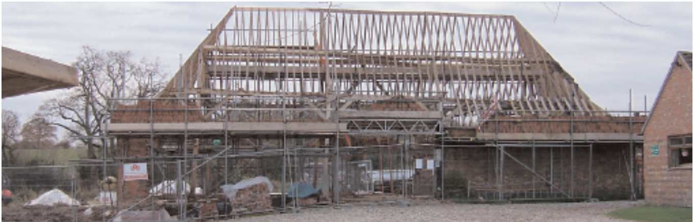
Elm Farm is being converted into office accommodation in phase two of the Organic Research Centre’s redevelopment programme.